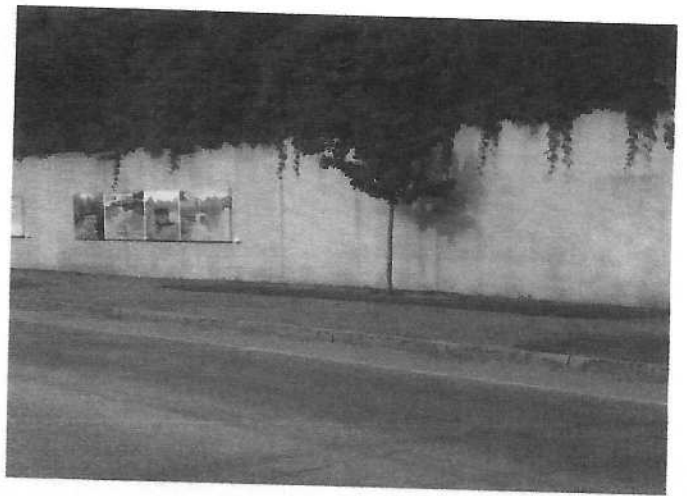
Art Wall – Main Street