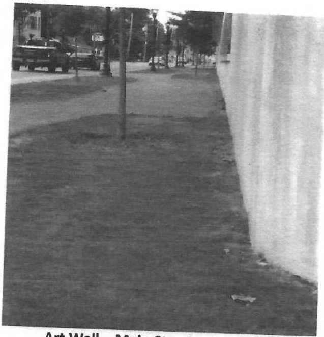
Art Wall – Main Street