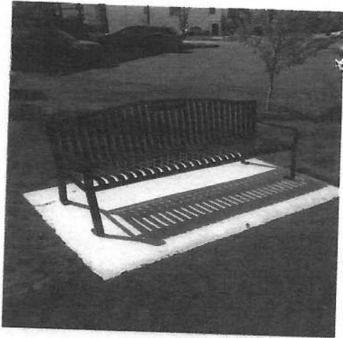
Proposed Bench $898.00 each