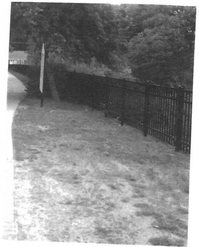
Esplanade near Falls